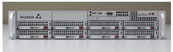
Arcplace Archiving Appliance

The use of a high-capacity, redundant storage system ensures that the Arcplace Appliance is able store very large volumes of data, while making it possible to efficiently search and retrieve this data.